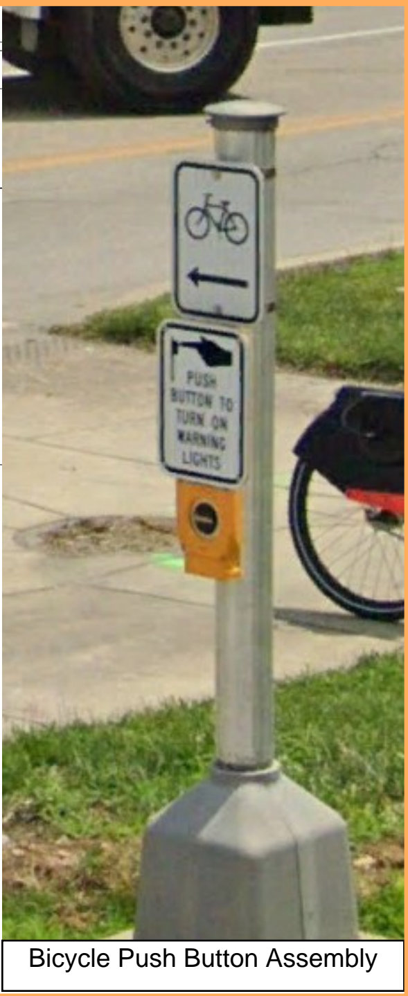
Bicycle Push Button Assembly