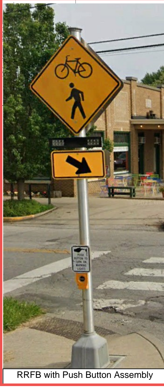
RRFB with Push Button Assembly