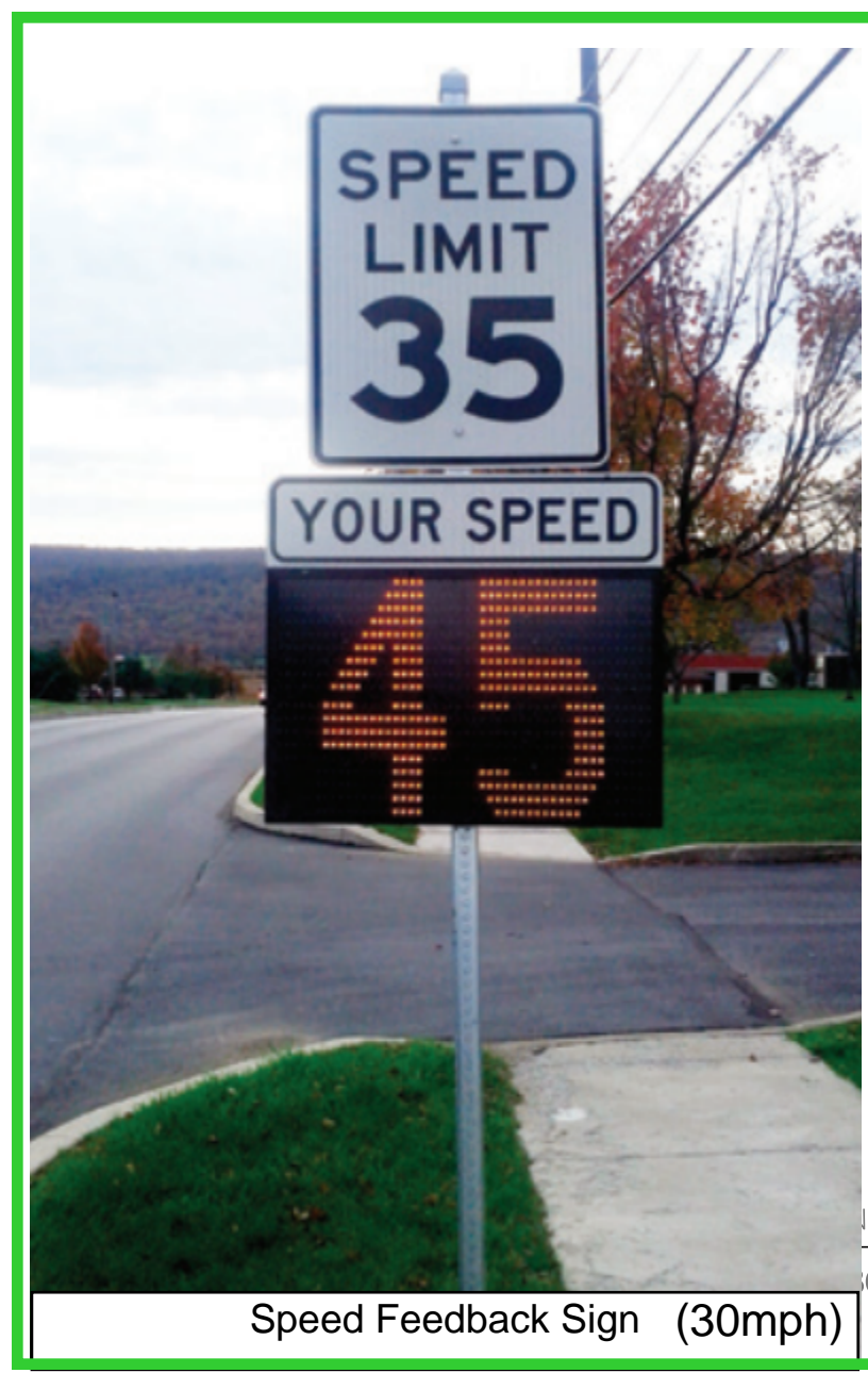
Speed Feedback Sign (30mph)