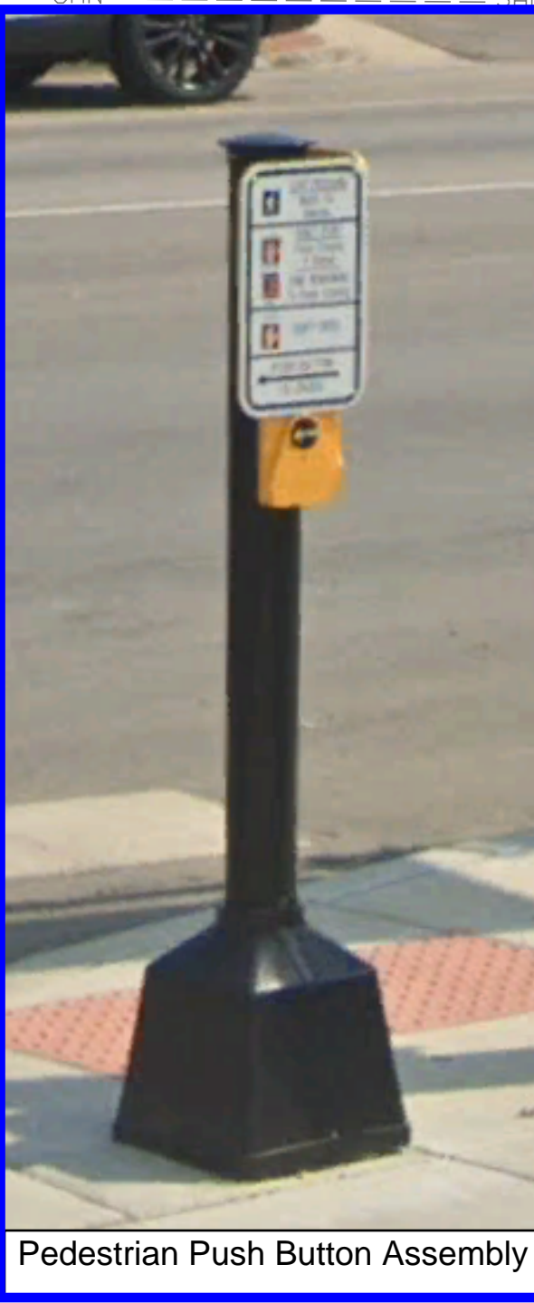
Pedestrian Push Button Assembly