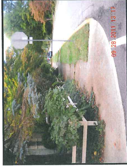
Looking West on 2 nd Street

Findings: On 09/28/2011, City Engineering received a complaint that trees and bushes were hanging over the sidewalks at the corner of E 2 nd St and S Hawthorne Dr. A site visit on 09/28/2011 (see photos) revealed that the bushes and trees on the property at 600 S Hawthorne Dr were hanging over the sidewalks and forcing pedestrians to be diverted into the street. A minimum clearance of 8 feet is required over the sidewalk and the current condition is in violation of Bloomington Municipal Code 12.24.040. During this visit I attempted to contact the property owner by knocking on the door but nobody answered.