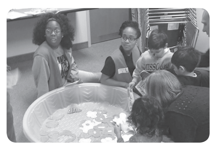
Find additional Parks and Recreation Department volunteer opportunities online at bloomington.in.gov/parksvol.